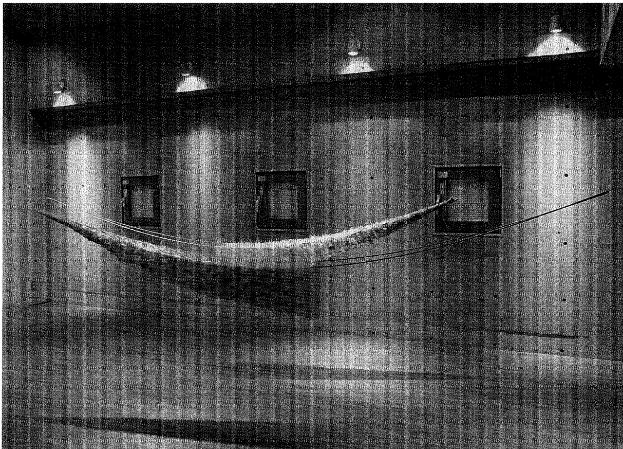
MAKIKO ROKUMURA — COME INTO BEING — 1997.3 (GALLERY MARONIE / KYOTO)